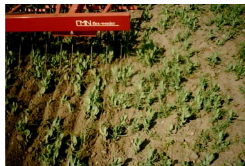
Weed control in peas – last treatment