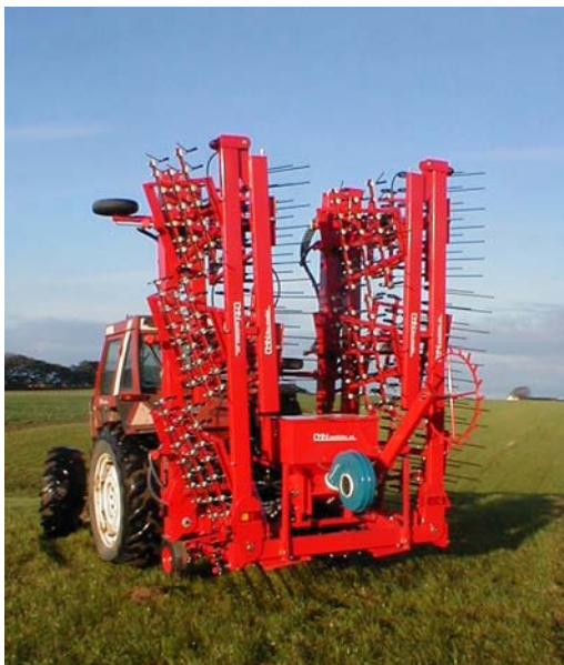
12 m with pneumatic sowing machine in transport position

The CMN flex-weeder has an effective tine spacing of 4.5 cm and are divided between three bars, which in turn are connected in parallel with an infinitely variable shift arrangement. This enables the tine angle to be varied from vertical to 45° backwards in relation to the surface of the soil. Thanks to the infinitely variable adjustment of tine aggressiveness it is possible to adjust the cultivator to optimum weed control regardless of soil type and crop. The special design of the tines makes them very sensitive laterally. This means that they find their way round the cultivated crop and also ensure effective soil spreading.