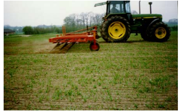
Weed control in peas

The CMN flex-weeder has a main frame of no more than 3 metres in length per section. Mounted underneath these frames are sections of 1 metre in width to which the long tines of the cultivator are fastened on transverse bars. The bottom sections are centrally mounted in such a way that they can work independently of each other, i.e. even if the surface of the soil is not completely level, the cultivator will compensate thanks to the moving sections.