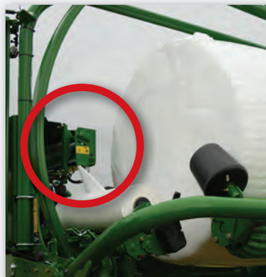
RELIABLE CUT AND HOLDS