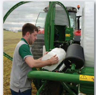
EASY FILM LOADING