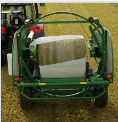
VERTICAL WRAPPING RING